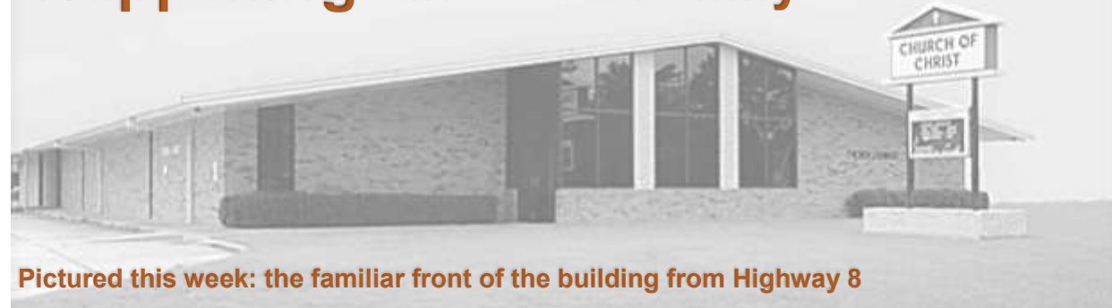
Pictured this week: the familiar front of the building from Highway 8