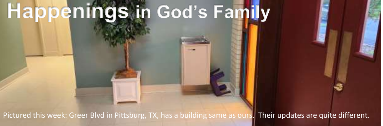
Pictured this week: Greer Blvd in Pittsburg, TX, has a building same as ours. Their updates are quite different.

If we this day be examined of the good deed done to the impotent man, by what means he is made whole; Be it known unto you all, and to all the people of Israel, that by the name of Jesus Christ of Nazareth, whom ye crucified, whom God raised from the dead, even by him doth this man stand here before you whole. (Acts 4:9-10)