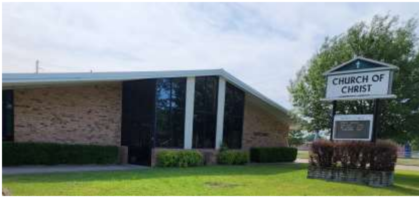
Vol. 52 No. 28