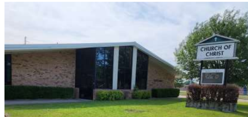
Vol. 52 No. 26