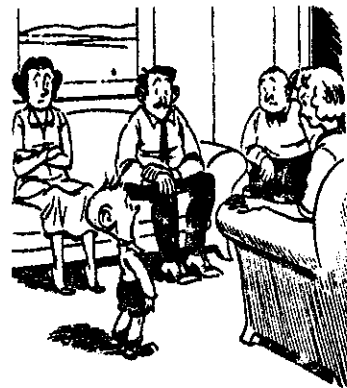
"WHY DO THEY CLOSE CHURCH AND SUNDAY SCHOOL EVERY TIME WE HAVE WEEKEND COX.PAN.Y 7"