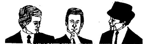
GENERAL BUSINESS MEETING

All the men of the congregation are encouraged to remain after services Sunday evening (28th) for our General Business Meeting. This is an excellent time for input and questions pertaining to our church work and family. We hope that you will plan to be present for this meeting.