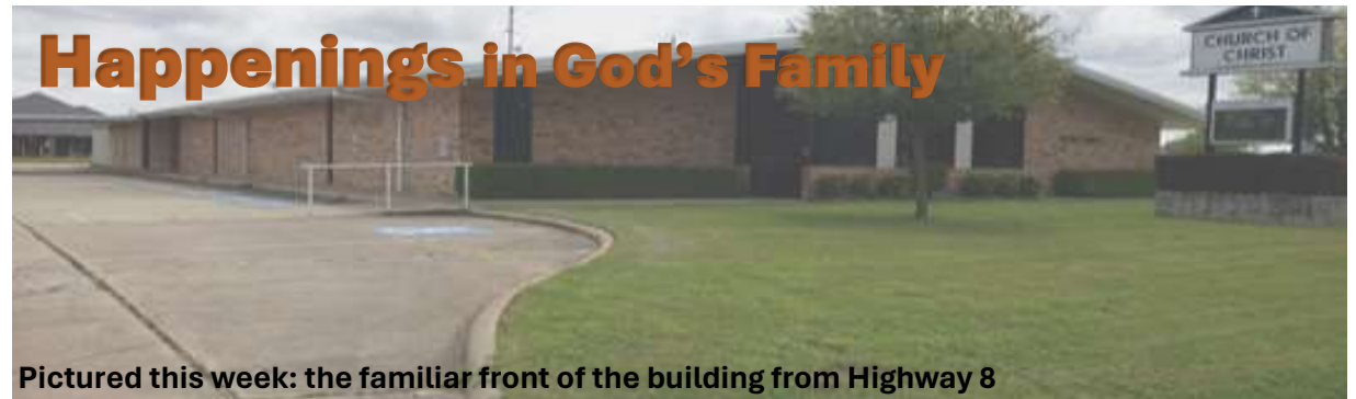
Pictured this week: the familiar front of the building from Highway 8