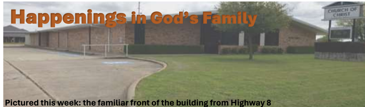
Pictured this week: the familiar front of the building from Highway 8