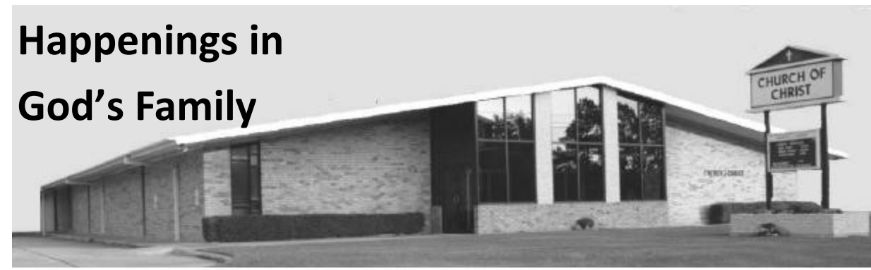
Vol.44 No.11 March 22, 2015