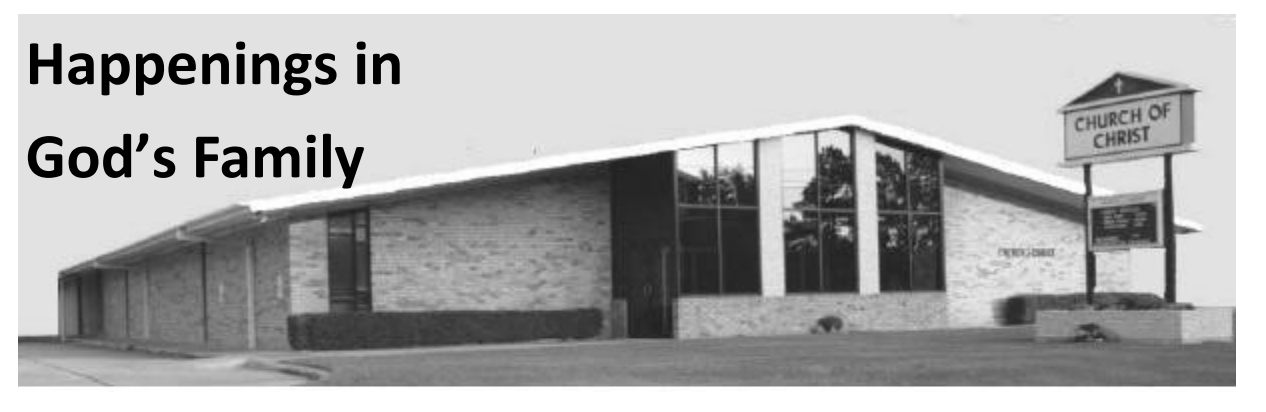
Vol.44 No.14 April 12, 2015